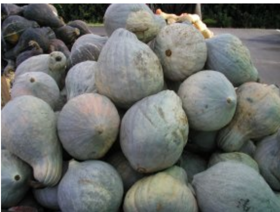
Gray Hubbard Squash

Available year-round - is best season is late summer through early winter.