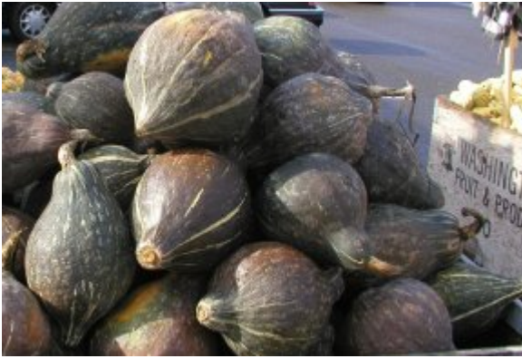
Green Hubbard Squash

Hubbard - The extra-hard skins make them one of the best keeping winter squashes. These are very large and irregularly shaped, with a skin that is quite "warted" and irregular. They range from big to enormous, have a blue/gray skin, and taper at the ends. Like all winter squash, they have an inedible skin, large, fully developed seeds that must be scooped out, and a dense flesh.